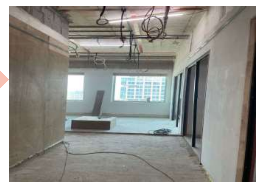
AIFS Office Space in Brigade BIFC