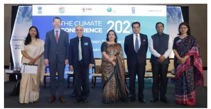
Chairperson, IFSCA Shri K. Rajaraman (second from right) with other key dignitaries at the inaugural session of the climate conference

The conference highlighted India's strategy for reaching net-zero emissions by 2070. It emphasized the importance of investing in green transitions to reshape energy systems, cut down CO2 emissions, preserve natural resources, boost biodiversity, and improve climate resilience in a fair and inclusive manner. Additionally, it examined the present climate finance scenario in India, discussing the contributions of government entities, venture capitalists, corporations, and industry leaders.