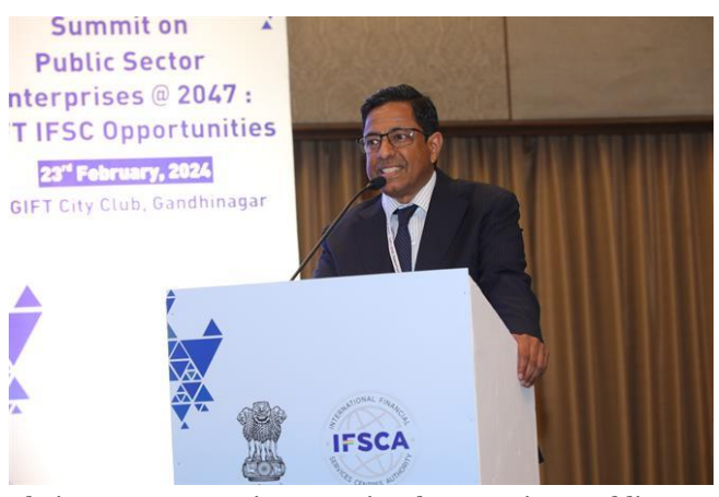
Chairperson, IFSCA, inaugurating the summit on Public Sector Enterprises @ 2047: GIFT IFSC opportunities

During the Summit, MDs and senior executives from leading PSEs such as ONGC Videsh Ltd., Power Finance Corporation Ltd. and Indian Oil Corporation Ltd. shared their experiences of setting up business operations in GIFT IFSC for undertaking international financial services businesses, including Global Treasury Centre operations, foreign currency borrowing, holding company structure, etc.