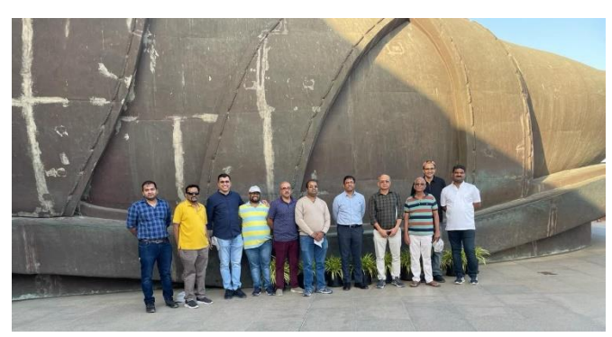
IFSCA officials visiting Statue of Unity and other state-of-the art infrastructure and facilities at Kevadia on first day as a part of Chintan Shivir

IFSCA had organized two-day Chintan Shivir headed by Chairperson, IFSCA on March 12-13, 2024, at Kevadia, Gujarat. The event drew the active participation of IFSCA officers and employees, marking a pivotal milestone in charting the organization's course forward.