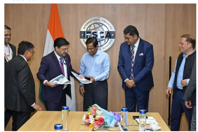
Expert Committee for developing GIFT IFSC as "Global Finance and Accounting hub" submitting its report to Chairperson, IFSCA

The committee submitted its report on March 26, 2024, recommending a comprehensive regulatory regime for undertaking Bookkeeping, Accounting, Taxation and Financial Crimes Compliance services from IFSC in India. The report is available on IFSCA website.