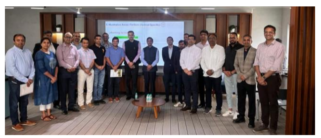
IFSCA Chairperson with other representatives from IFSCA, FinTech Founders and IAMAI officials in Bengaluru

A FinTech Founders meet was organised by IFSCA in association with IAMAI in Bangaluru on February 03, 2024. Chairperson, IFSCA interacted with FinTech Founders at Bengaluru on February 03, 2024, and encouraged them to the various possibilities explore opportunities at GIFT IFSC to embark upon their IFSC journey. The discussion topics included Reverse flipping, Direct Listing at IFSC Exchanges, Accredited Investors, IFSCA Payment Services Regulations and TechFins enabled through the FinTech Entity Framework.