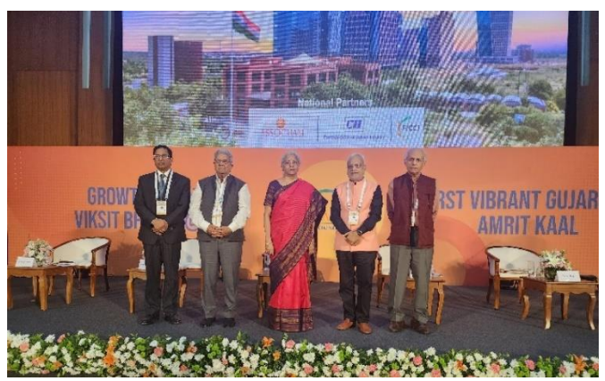
Chairperson, IFSCA, at seminar on 'Gift City - An Aspiration of Modern India' at VGGS 2024, chaired by Hon'ble Union Minister for Finance Smt. Nirmala Sitharaman

On January 11, 2024, a daylong seminar was held on GIFT City and IFSC at Mahatma Mandir on the theme "GIFT City – An Aspiration of Modern India". The Hon'ble Finance Miniter delivered the keynote address at the plenary session of the seminar. The seminar comprises of three distinct panel discussions on the role of International financial centres, right connect of Tech & Fin – emerging trends globally and Building Sustainable & Future-proof City.