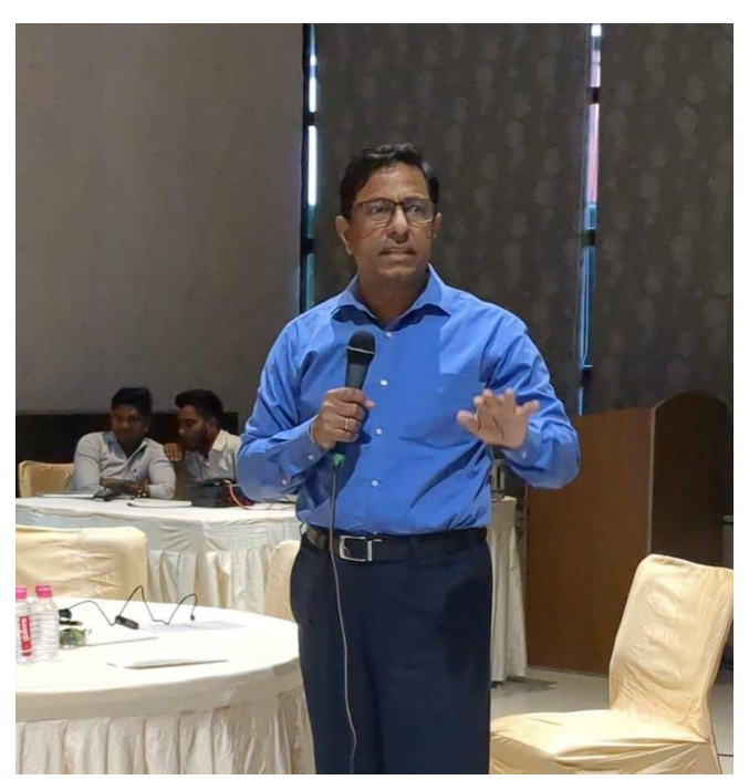
Chairperson, IFSCA, delivering closing remarks on conclusion of two-day Chintan Shivir