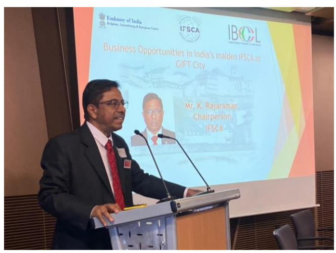
Chairperson, IFSCA, at IFSC Conference in Luxembourg based on the theme "Business Opportunities in India's maiden IFSC at GIFT City"